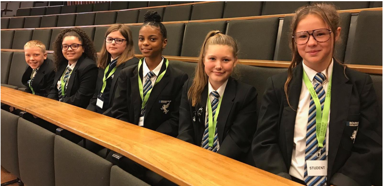
Year 9 Forward Thinking Trip